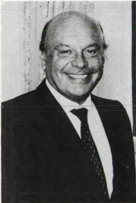
Dr. Primo Nebiolo (ITA)