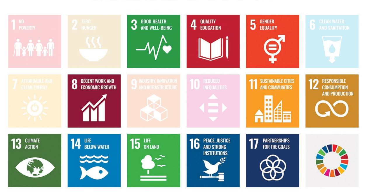
Figure 1 UN SDG's to which the IOC aims to contribute towards