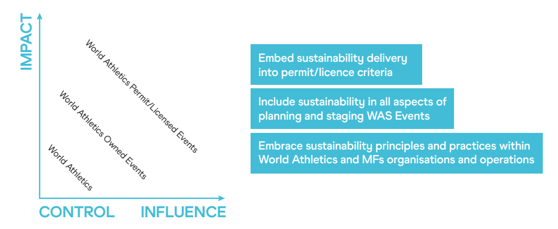
Figure 4: World Athletics sustainability framework of impact, control and influence

The sustainability strategy sets out World Athletics's commitment to accelerating athletics towards a sustainable future, contributing to a better world. In some areas, this will require a change from 'business as usual', in some cases it will be about influence and specification and in others it will be around developing partnerships to deliver scalable change. Figure 4 shows the starting framework identifying the key areas of impact, control and influence and importance of working with the stakeholders, in particular across the permitted and licenced events.