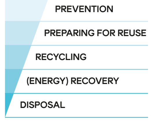
Figure 5 Waste Hierarchy

Key areas for sustainable procurement are temporary event structures, equipment and clothing, energy and power, food sourcing, travel and transport and the venues/ stadia hosting the events.