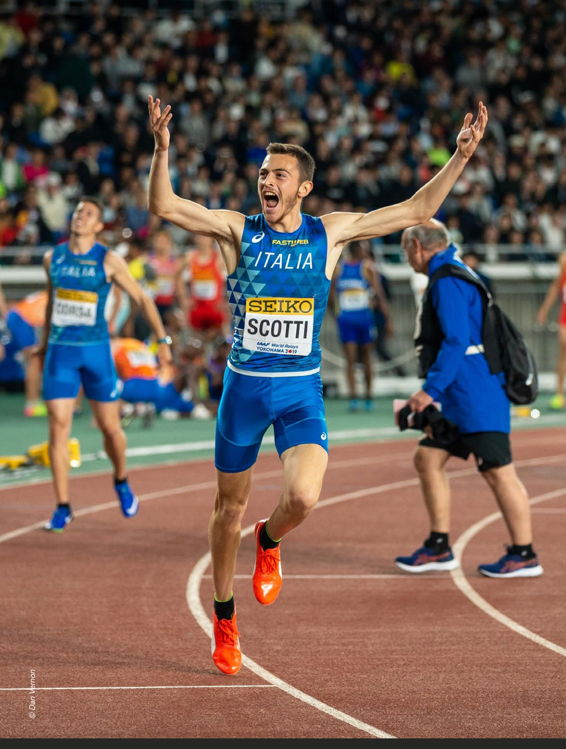
Bid Guide World Athletics Relays