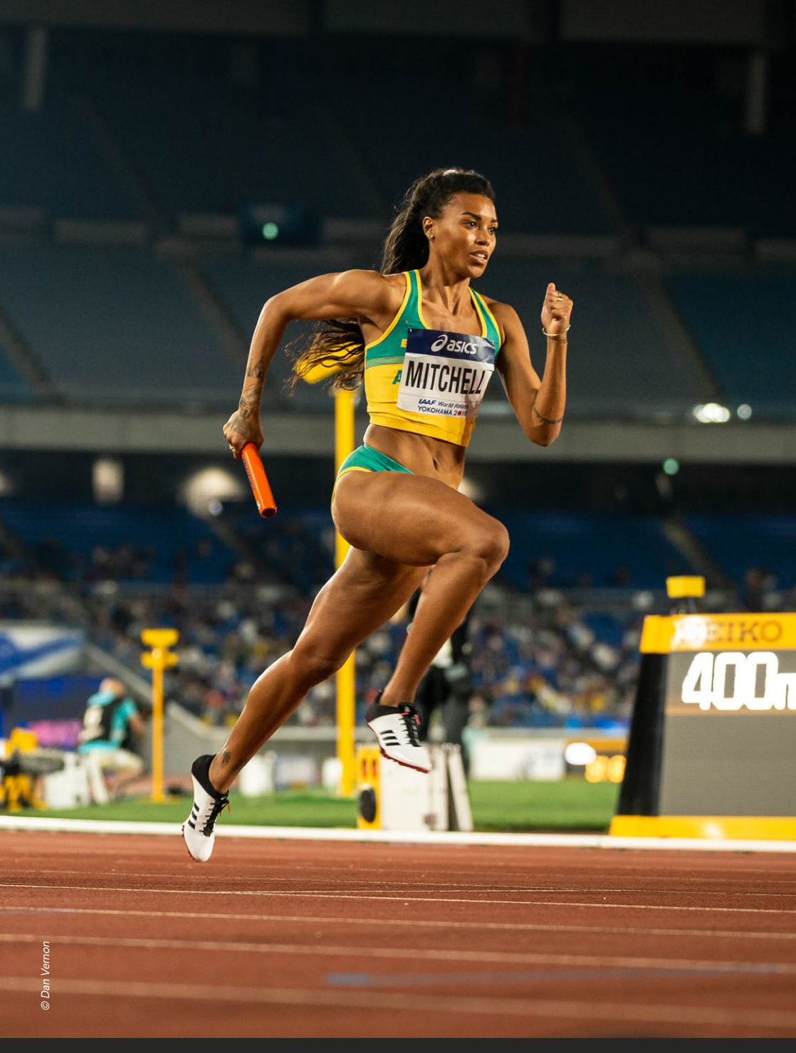
Bid Guide World Athletics Relays