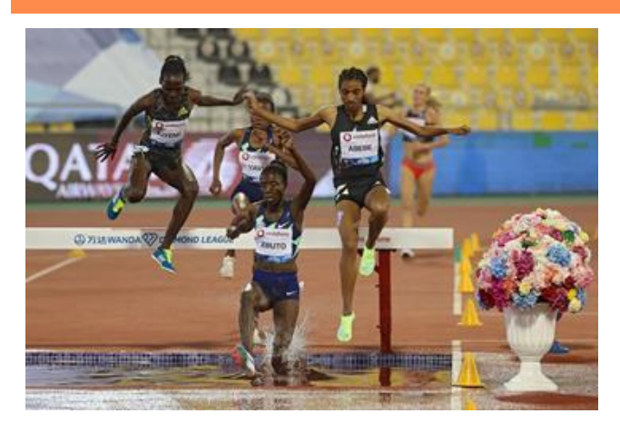
World leads and meeting records set as Wanda Diamond League heats up in Doha