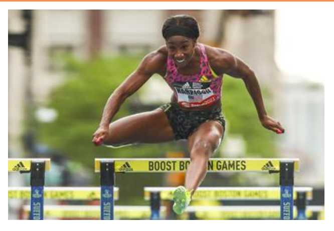
<u>Hurdle stars Holloway and Harrison lead record blitz at</u> Continental Tour Gold meet in Boston